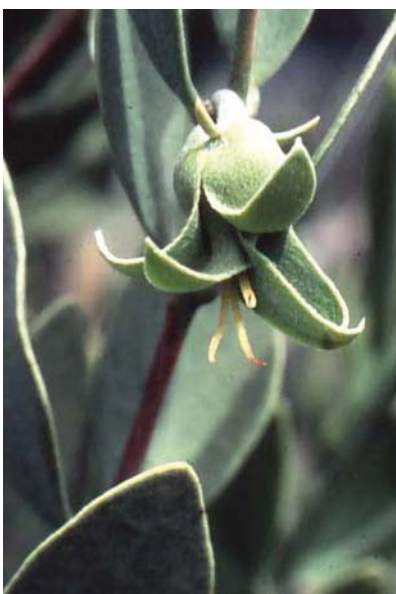
Simmondsia chinensis .

Often, these natural ingredients do not provide the same benefits, esthetically and functionally. In addition, natural ingredients that offer superior functionality are often expensive, which in turn leads to higher priced products. One way of attacking this issue is to incorporate natural ingredients in combination with synthetic ingredients which produce a functional and esthetically superior product.